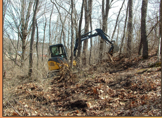
Working their way up the slope clearing limbs and briars for the new trail.

The Carantouan Greenway was fortunate to receive the support of the Tioga County Soil and Water Conservation District that had a grant to facilitate a project with a not-for-profit group. The