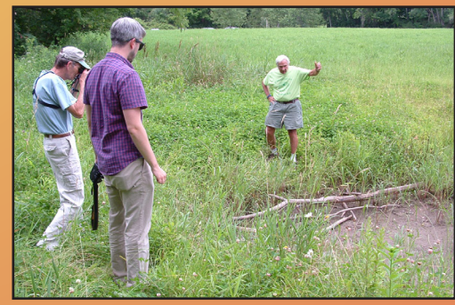
In a few short months Mother Nature has turned the new pool into a thriving, verdant ecosystem.