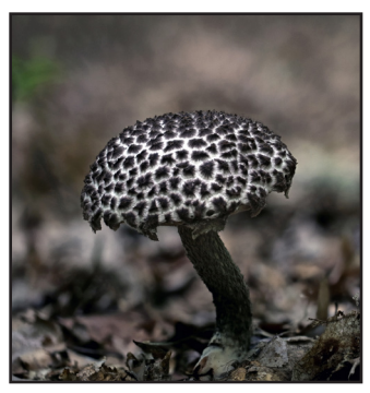
Old-man-of-the-woods mushroom.

This spring has been an exceptional year for the proliferation of a variety of fungi off our Wildwood trails. I was able to identify my first old-man-of-the-woods, a very dark, hairy mushroom.