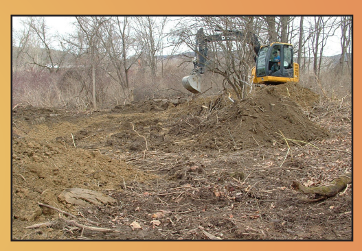
Work progresses on the shallow vernal pool that will create a sanctuary for mating insects and amphibians during the spring and summer.

Greenway suggested that we could use that resource to do two things. One would be to modify our trail that was a deadend going to the Barton landfill and modify the trail so that it made a complete loop and did not necessitate backtracking. The other was to create another vernal pool or two at the base of the trail. The crew, which did the work, were the skilled technicians of the Upper Susquehanna Coalition (USC). They created the loop trail, created not one but three vernal pools and seeded the entire disturbed site so that there was absolutely no run-off or erosion